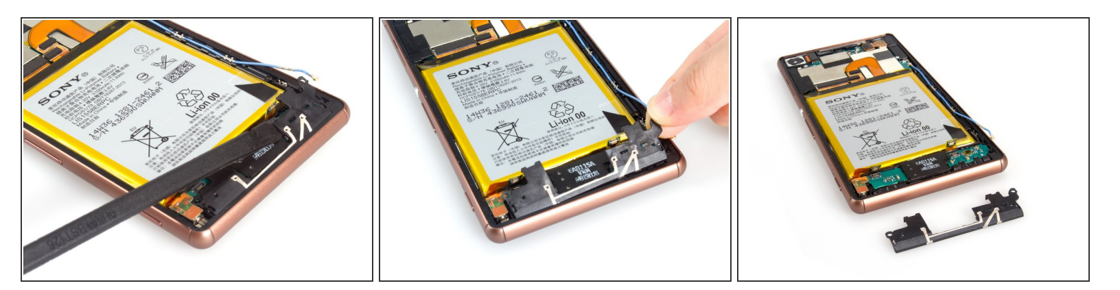
• Remove the securing cover. It's thin and weak, please be careful when remove it.